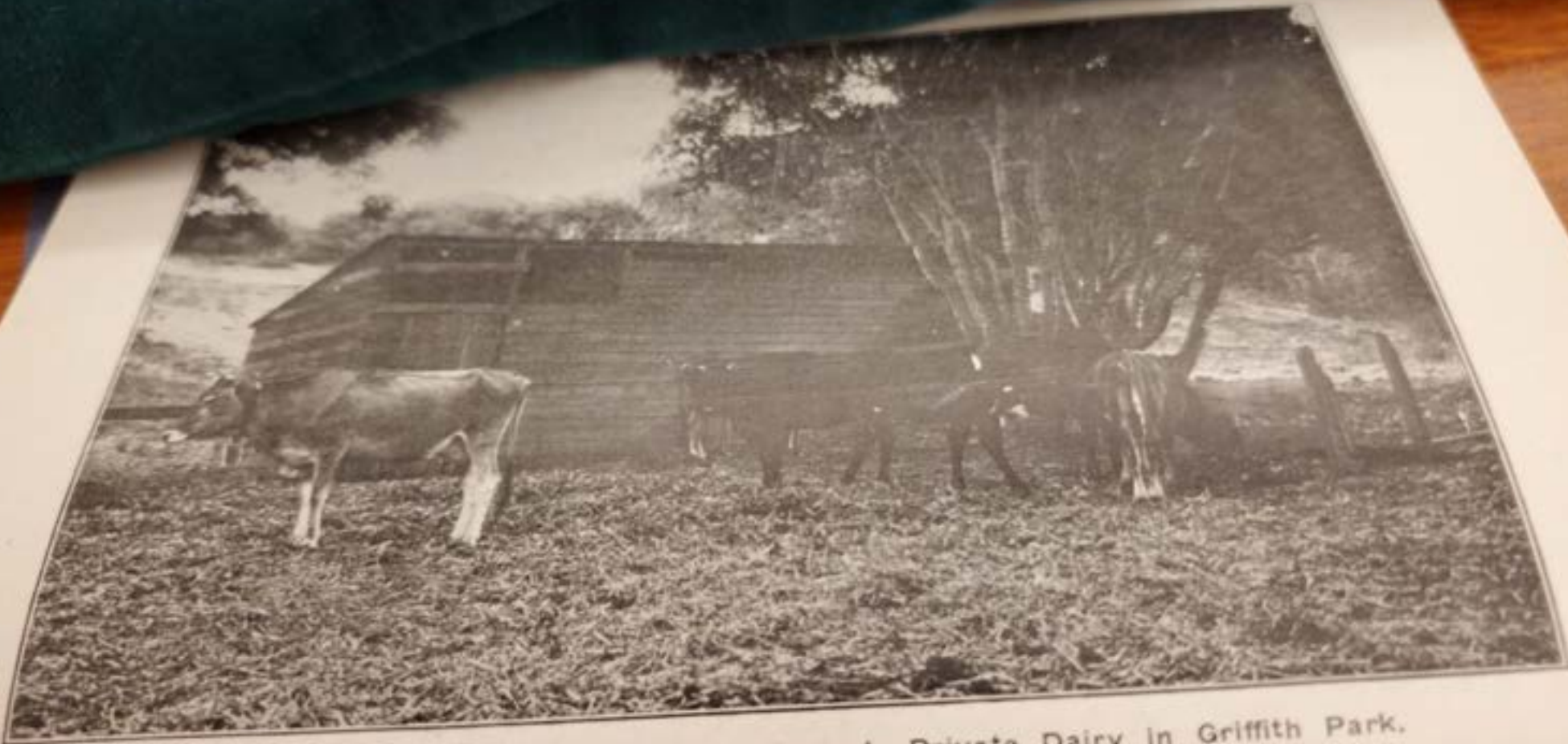
"A Public Office Is a Private Snap." Keeper's Private Dairy in Griffith Park. Would such mistreatment induce others to make donations to the city?