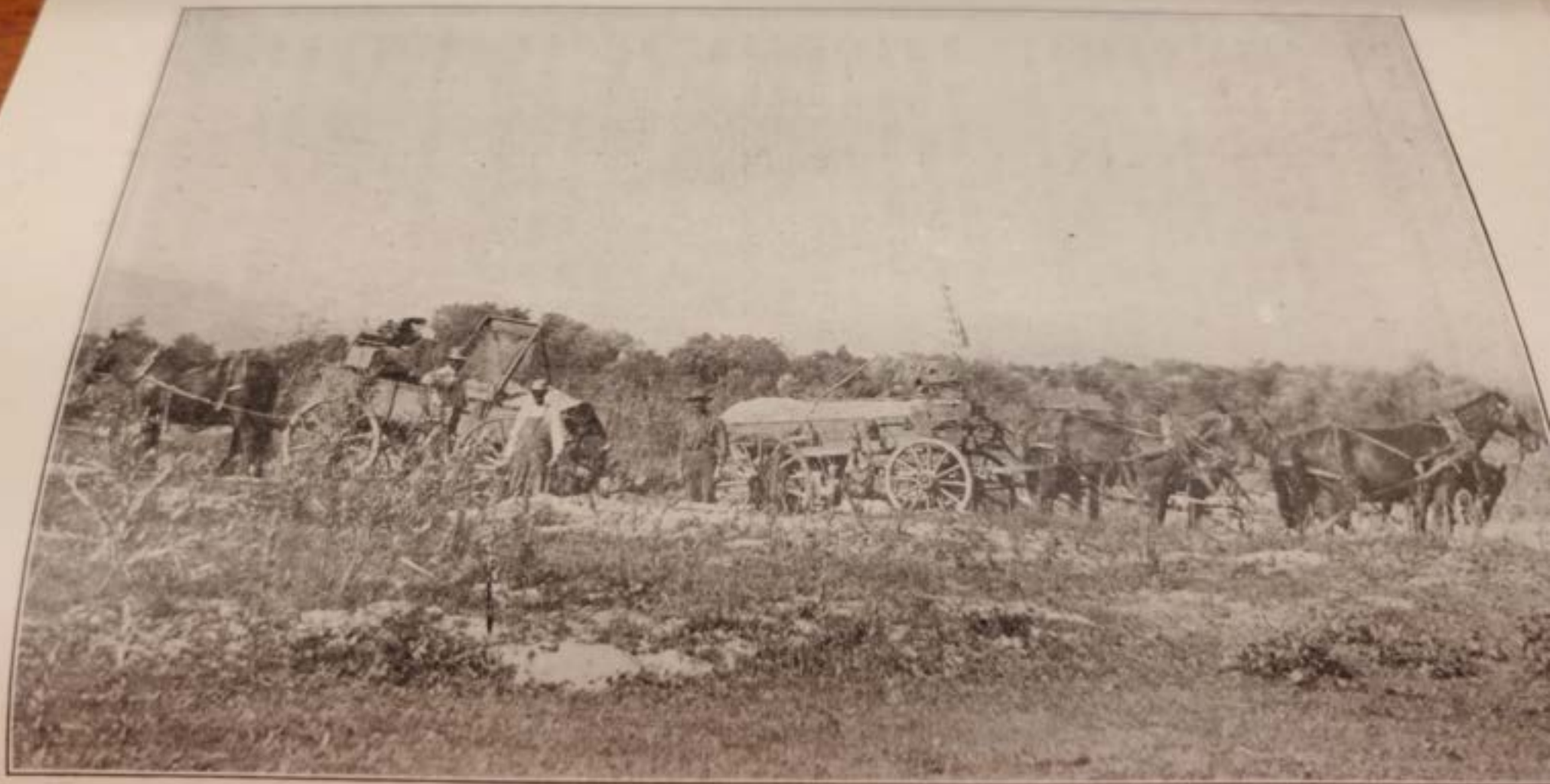
Private Parties Hauling Sand and Gravel Out of Griffith Park, Sold at Ten Cents a Load. Would such mistreatment induce others to make donations to the city?