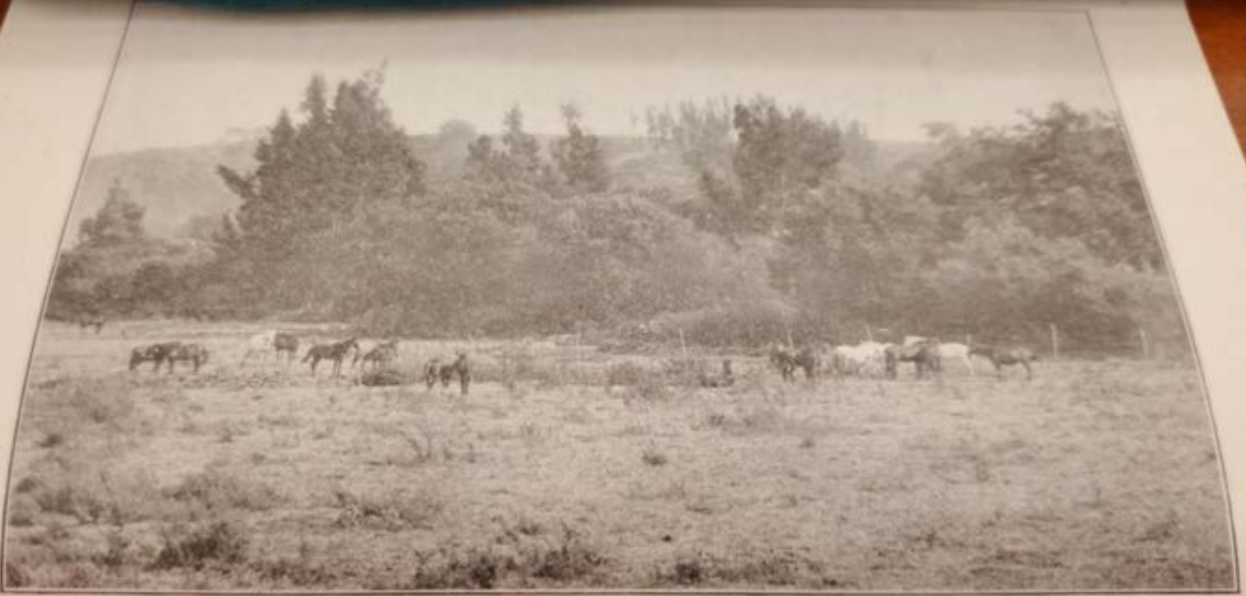
Group of 32 Horses and Mules, the Property of Private Persons, Grazing in Griffith Park. Would such mistreatment induce others to make donations to the city?