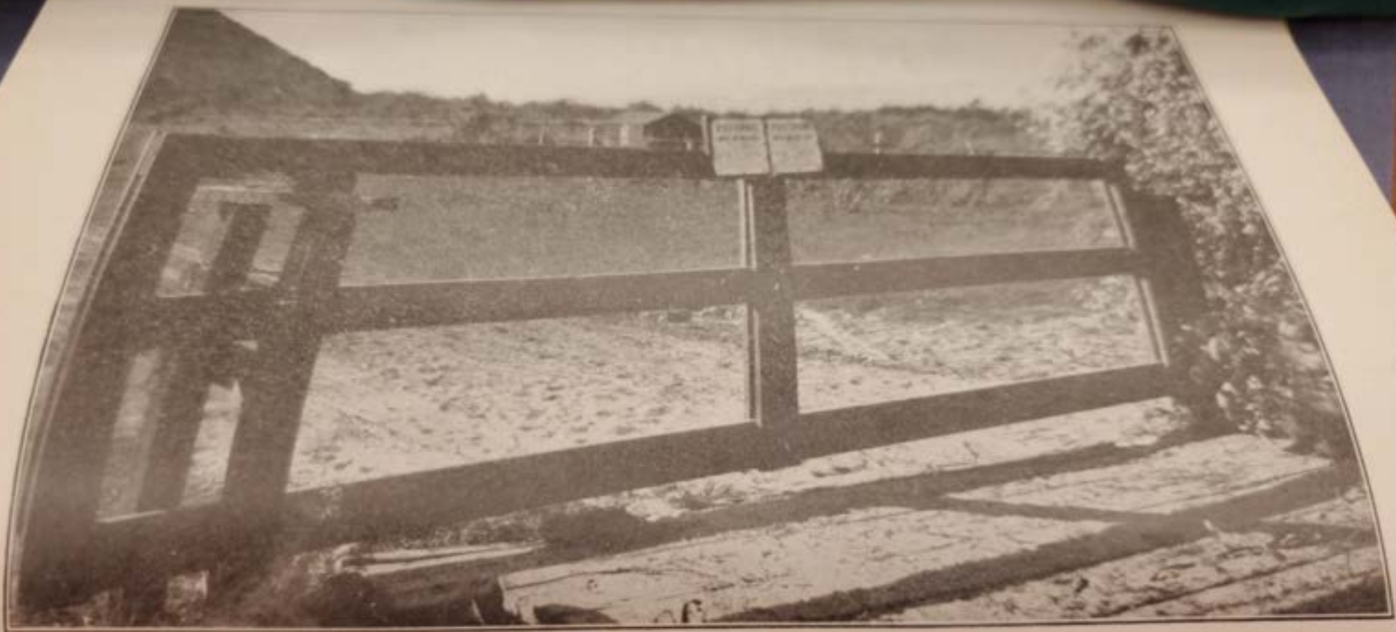
Private Pasture and House Erected in Griffith Park. Would such mistreatment induce others to make donations to the city?

the ab of exp but on special park which require were s dead r dition commi been r satisfa space by off indust autom Sim Highla series knowr New additio wild c pointe of suc its lat of 10, row an ment it to j and m Judge