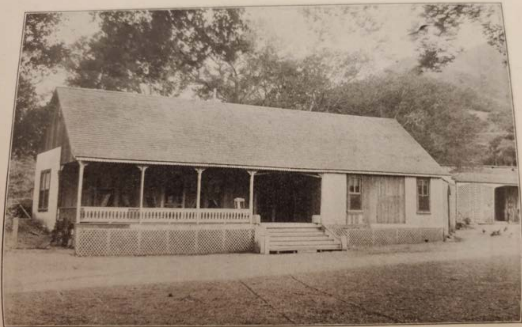
Under the Great Oaks in Griffith Park. (Keeper's Residence.)