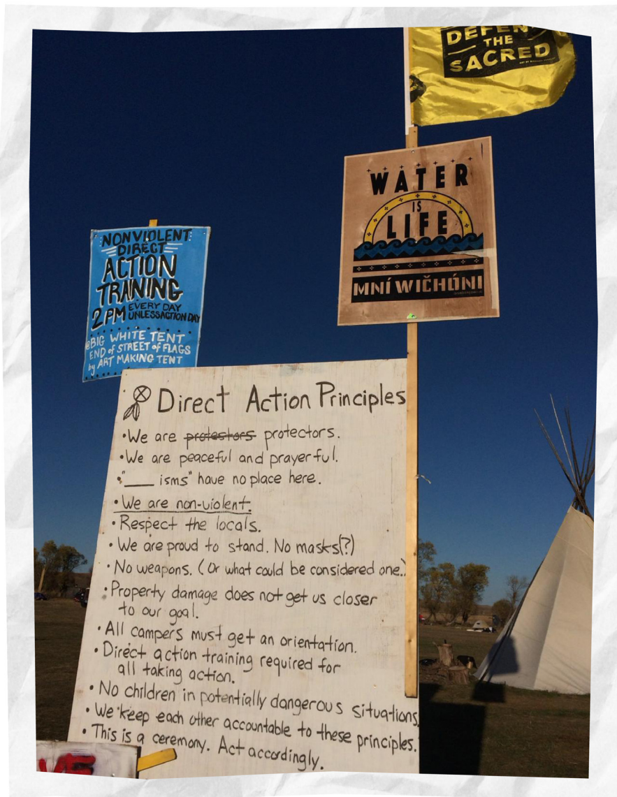
Standing Rock