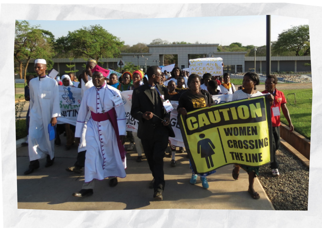
Crossing the line – JASS activists in Malawi, in alliance with faith leaders