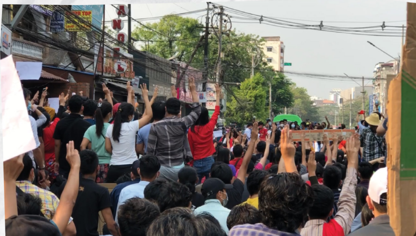
Protestors raise three fingers, Hledan Yangon, Myanmar